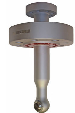
PROBE DESUPERHEATER SERIES 3-4000

SIZE: up to 6" RATING: 150 lbs - 1500 lbs BODY: CS / CrMo