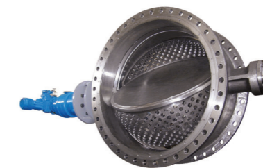
BUTTERFLY CONTROL VALVE SERIES 1-2483

SIZE: 8" - 80" RATING: PN 6-16 BODY: CC / SS / Duplex SS