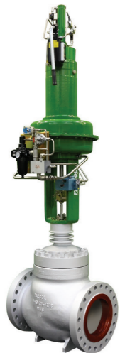
LIMIPHON CONTROL VALVE SERIES 1-9000

SIZE: 1" - 36" RATING: up to 4500 lbs BODY: CS / CrMo / SS / Duplex SS