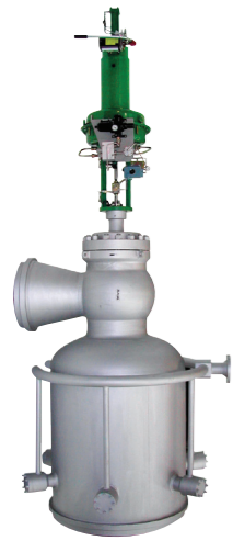
PRDS SERIES 1-5700

SIZE: up to 60" RATING: job rating BODY: CS / CrMo