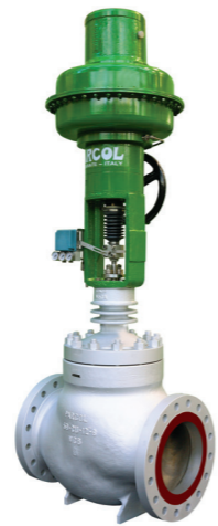
VeGA CONTROL VALVE SERIES 1-6940

SIZE: 3/4" - 24" RATING: 150 lbs - 2500 lbs BODY: CS / CrMo / SS / Duplex SS