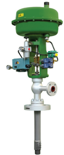
SPRAYSAT DESUPERHEATER SERIES 1-4442

SIZE: 1" x 3" - 3" x 6" RATING: job rating BODY: CS / CrMo