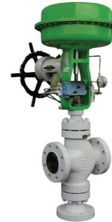
THREE WAY CONTROL VALVE SERIES 1-0003

SIZE: up to 12" RATING: 150 lbs - 600 lbs BODY: CC / SS / Duplex