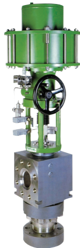
UREA CONTROL VALVE SERIES 1-4800

SIZE: 3/4" - 12" RATING: PN 160 - 320 - 420 BODY: SS / Duplex