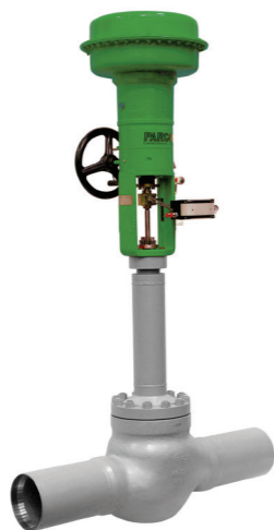
VeGA CRYO CONTROL VALVE SERIES 1-6940

SIZE: 3/4" - 24" RATING: 150lbs - 2500 lbs BODY: SS