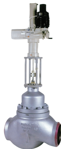
VARISTEP CONTROL VALVE SERIES 1-6962

SIZE: 3" - 16" RATING: up to 2500 lbs BODY: CS / CrMo