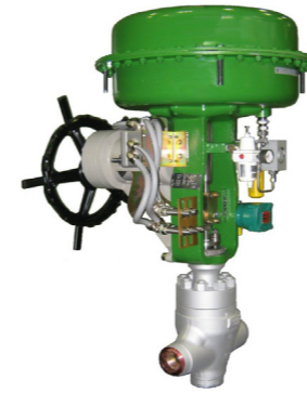
TANDEM PLUG CONTROL VALVE SERIES 1-7000

SIZE: 1" - 3" RATING: up to 4500 lbs BODY: CS / CrMo